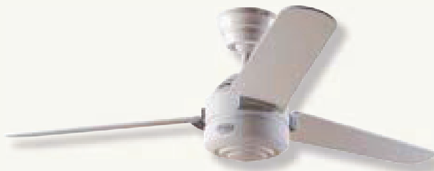
24246 Arch White finish with 3 White/Maple reversible blades