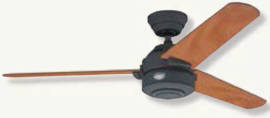
24241 Graphite finish with 3 Chestnut/Graphite reversible blades