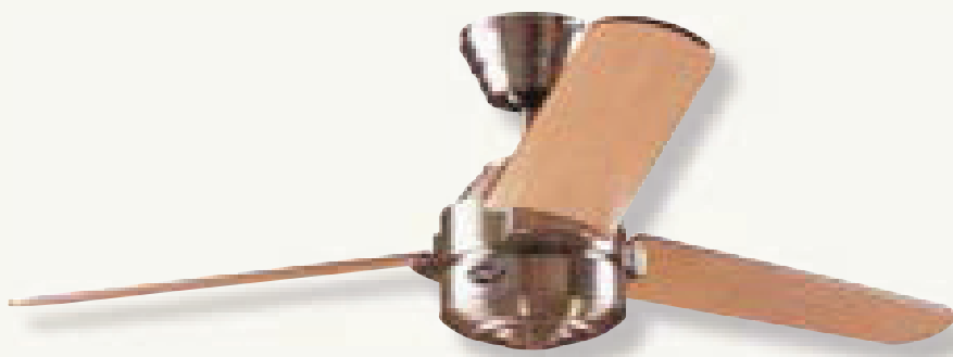
24243 Brushed Nickel finish with 3 Maple/Dark Walnut reversible blades