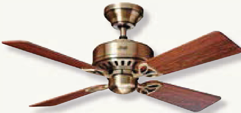
24174 Antique Brass finish with 4 Rosewood/Medium Oak reversible blades