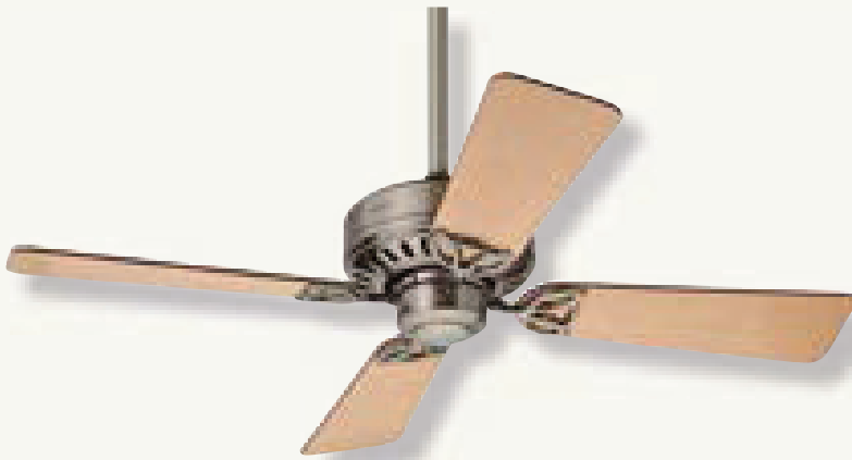
24179 Brushed Nickel finish with 4 Maple/Cherry reversible blades