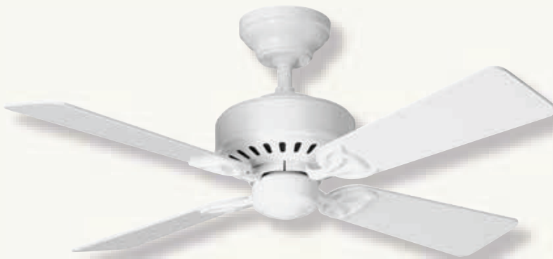
24170 White finish with 4 White/Light Oak reversible blades